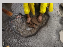
Brush away loose debris/standing water