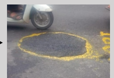
Immediately open to traffic