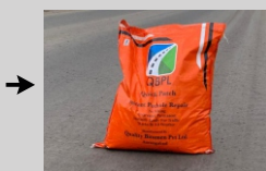
Simple Application Tools