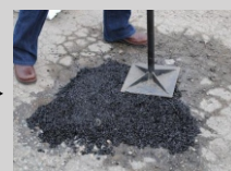
Compact with a rammer